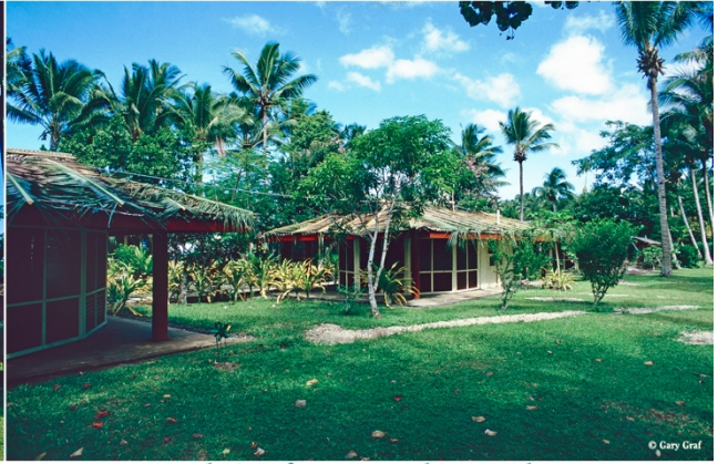
My accommodation for two weeks at Hideaway Resort