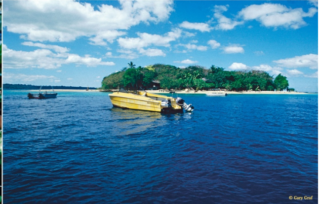
Hideaway Island, Port Vila, Vanuatu