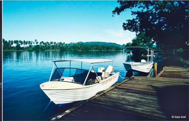
Jais Aben dive boat fleet