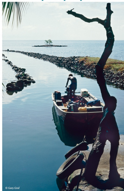
Walindi boat canal