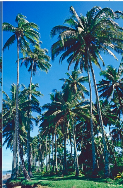
Palms along Upolu's southern shore