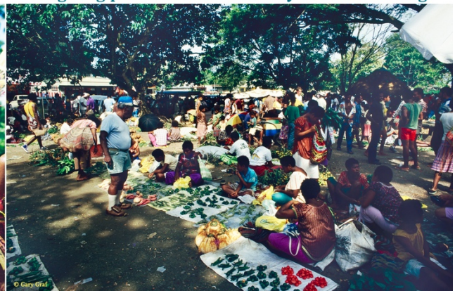
Market day in downtown Madang