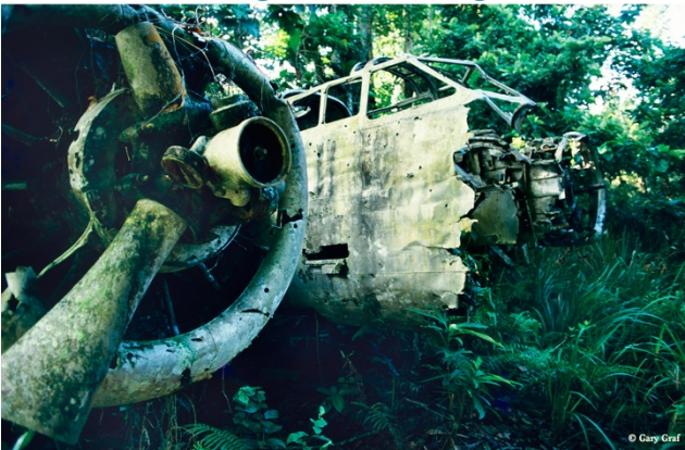
World War II plane wreck in jungle north of Madang