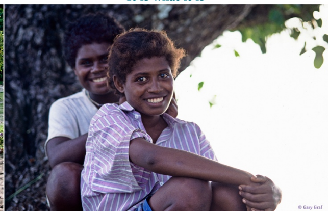
Some even seemed genuinely happy to see us