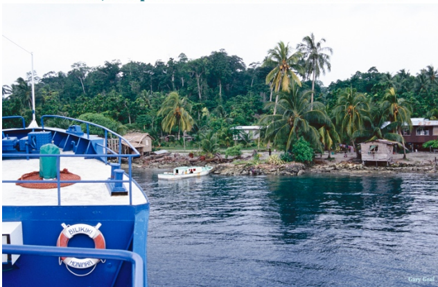
Bilikiki anchored off small island village