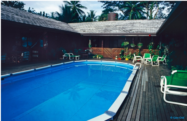
Walindi pool and lounge deck