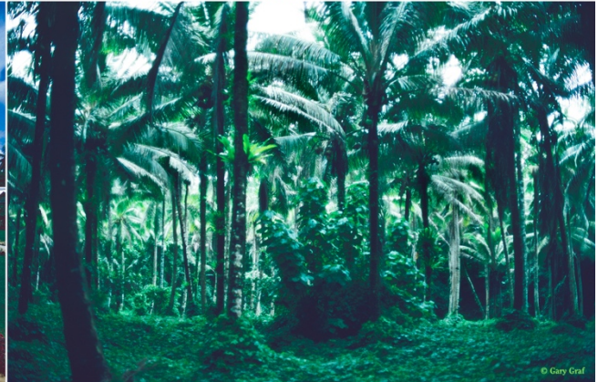
Lush rain forest, Upolu