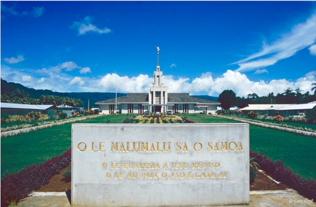
Mormon temple in Apia, destroyed by fire in 2003