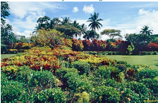
Rabaul public park pre-1994 volcanic eruption