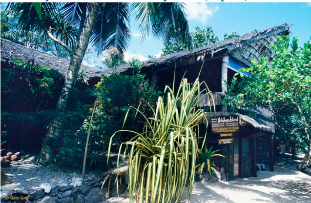
Hideaway Island Resort main entrance, Vila, Vanuatu