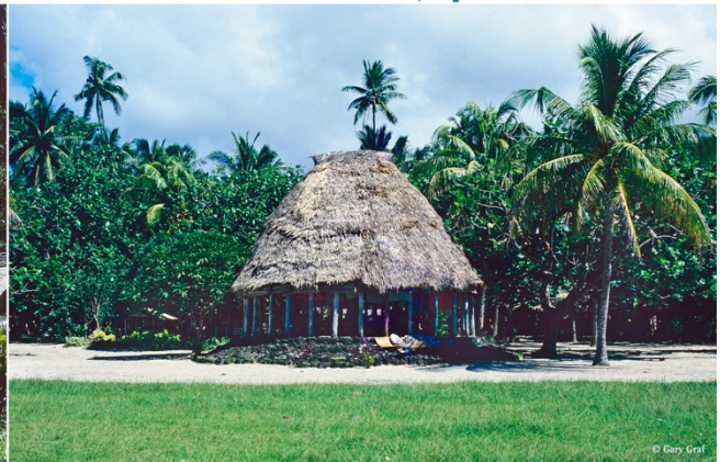
Typical fale-style abode in Samoa