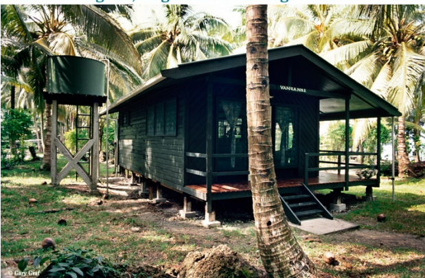
Where our cabin sat on Uepi Island