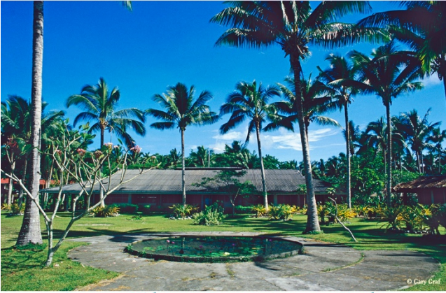
Samoan Hideaway Resort entrance, Upolu