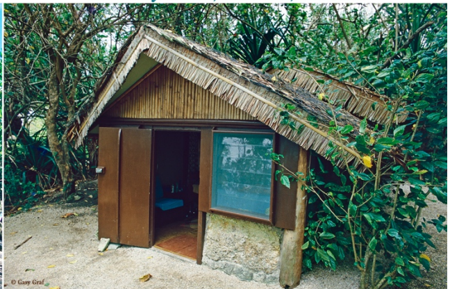
My accommodation on Hideaway Island, Vanuatu