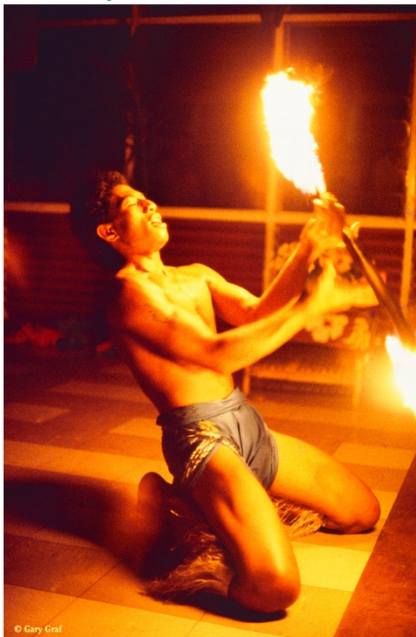
Resort staff fire dance, Samoa