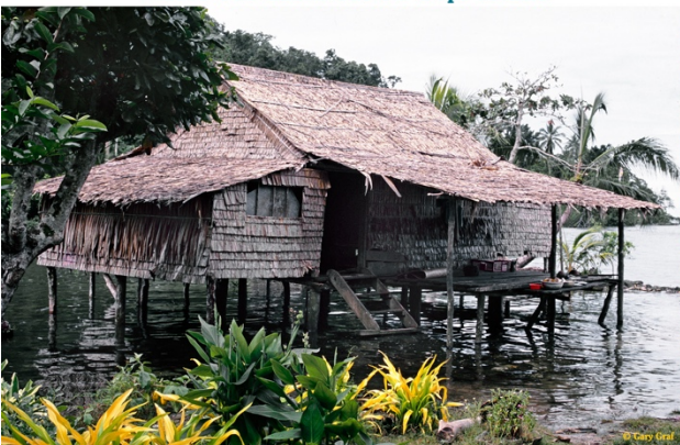
Waterfront home, nearby Chumbikopi