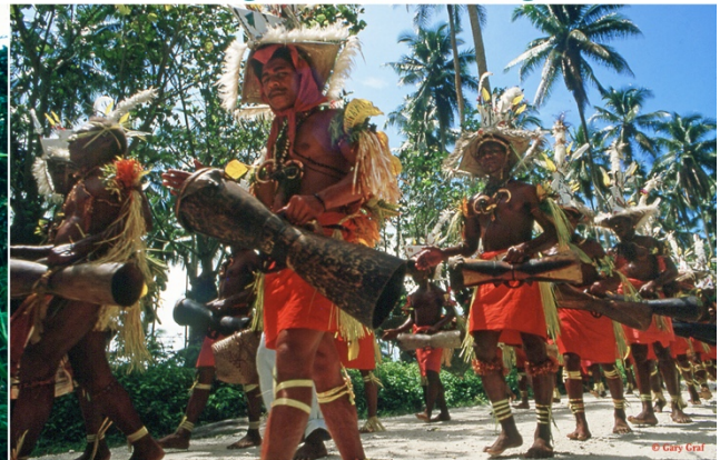
Sing-sing performers on their way to do their thing