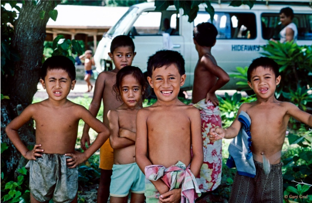
Aleipata kids and Hideaway HiAce, Upolu, Samoa