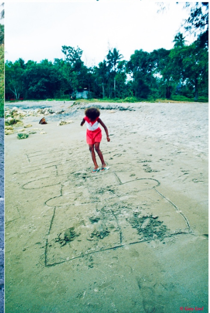
Hopscotch in the sand, Vanuatu