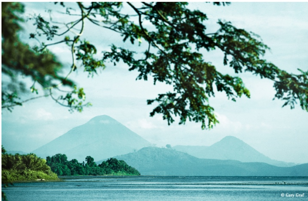
Volcanoes overlooking Kimbe Bay, New Britain