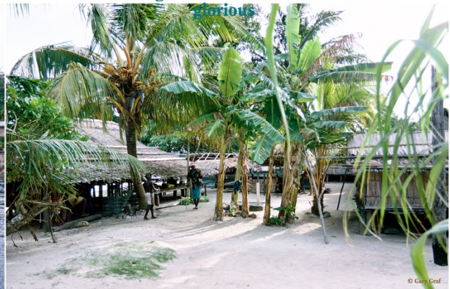
A closer look ashore