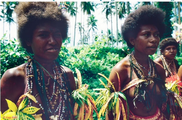
Sing-sing dancers, north of Madang