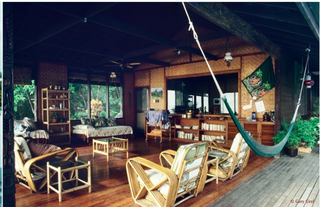
Walindi Plantation Resort lobby, Kimbe Bay