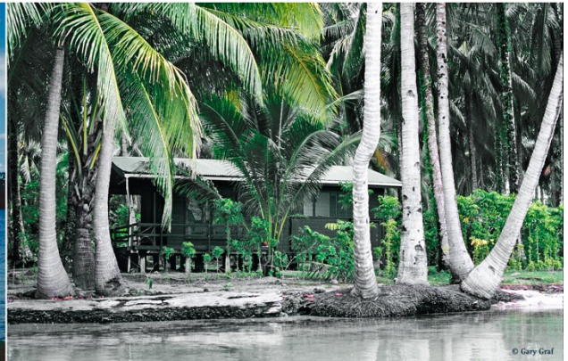
Uepi Island Resort sits right on Morovo Lagoon