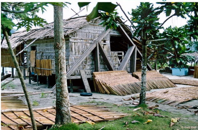
The village thatch factory