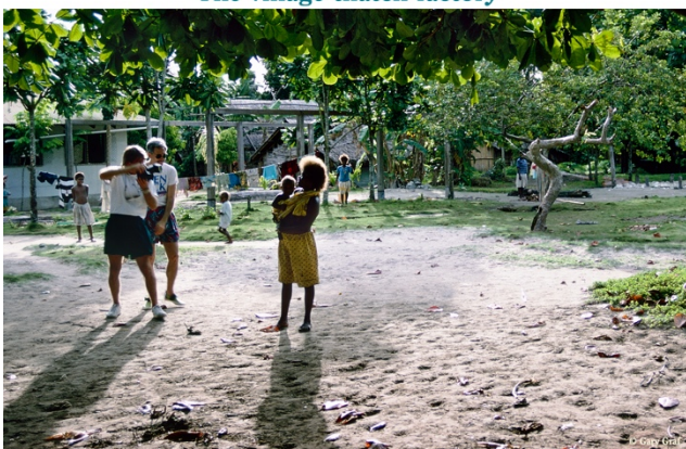
These villagers have become quite used to posing