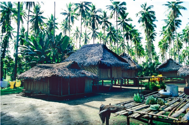
Village north of Madang