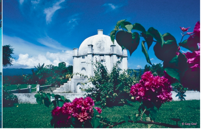
Mafata Mausoleum, Mulinu Peninsula, Apia, Upolu