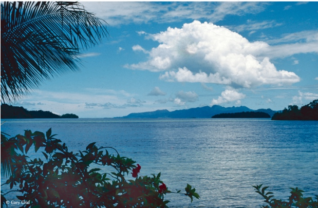
Morovo Lagoon, largest saltwater lagoon in the world