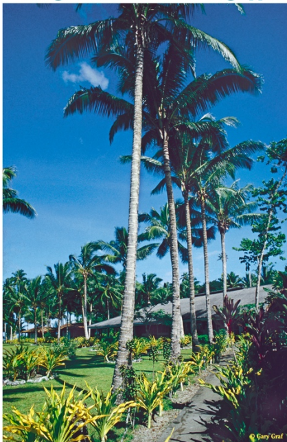
Rear of Hideaway Resort, Upolu