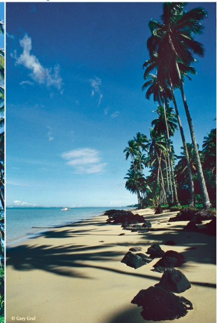
More of the same