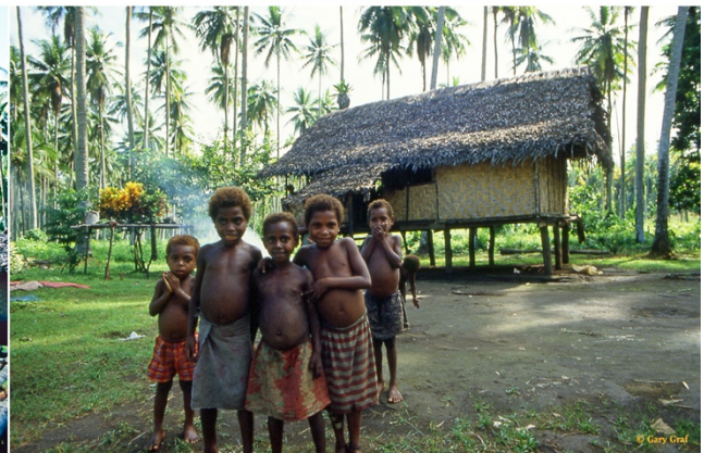
Village lads north of Madang