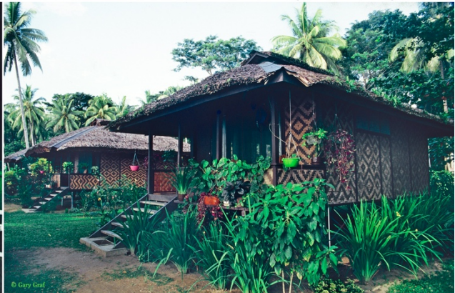
Walindi guest cabins