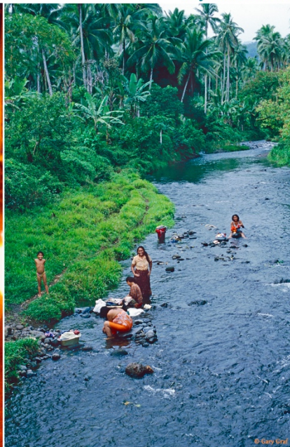
Wash day, Upolu, Samoa