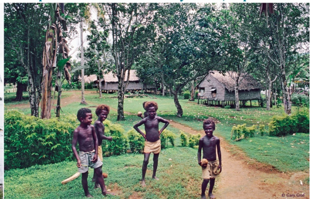
Chumbikopi village kids