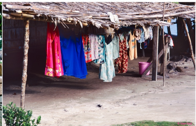
It is what it is