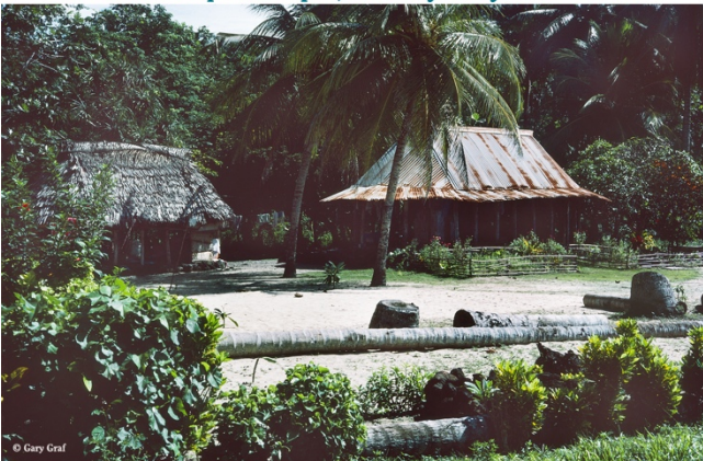
Village homes with differing approaches to roofing