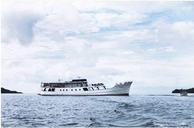
Bilikiki , the premier dive boat in the Solomons