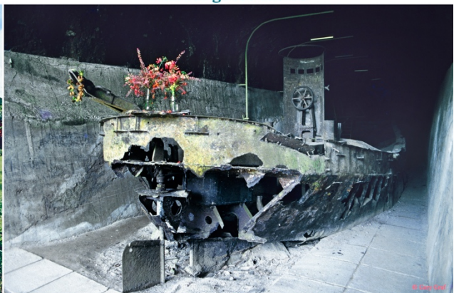
Japanese barge in cave, Rabaul