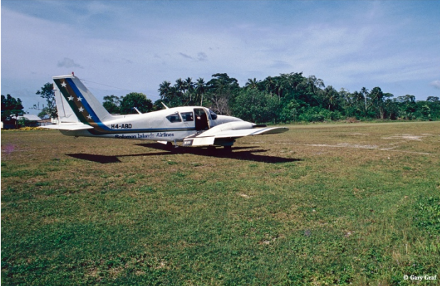
How you got there and the field where you landed