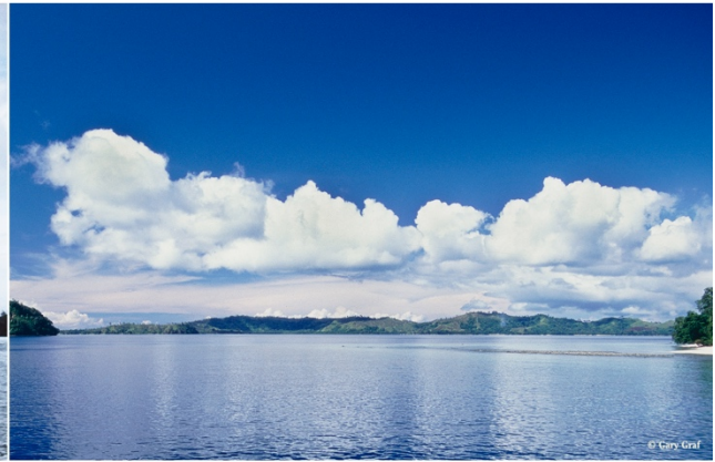
Some of the glorious waters Bilikiki cruises