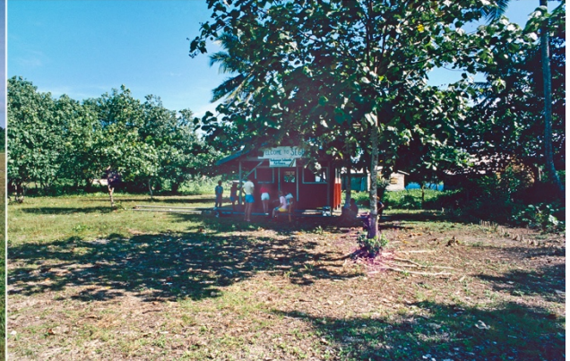
Seghi Air Terminal; they used bathroom scales