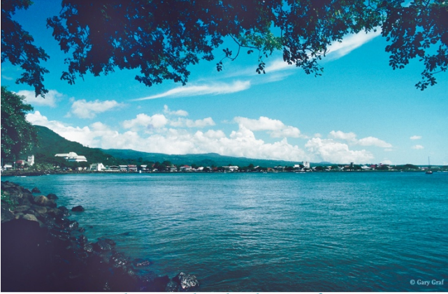
Apia, the capital and only city of Samoa