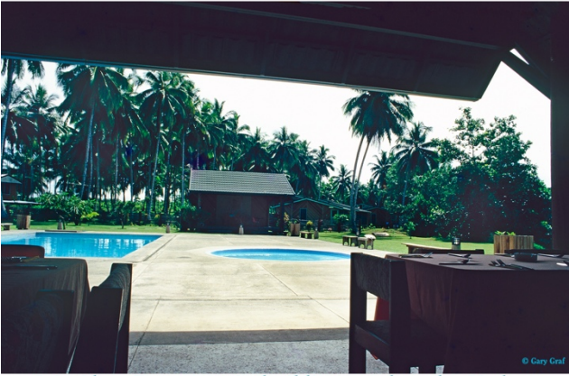
Jais Aben Resort main buildings and pools, Madang