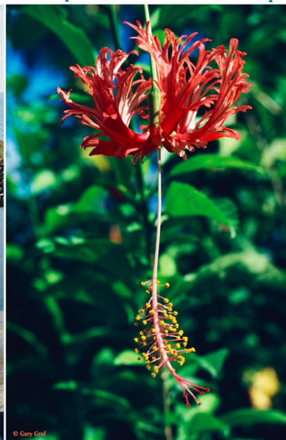
Exotic flower at Walindi