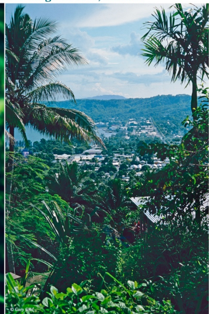
Rabaul from handy hillside